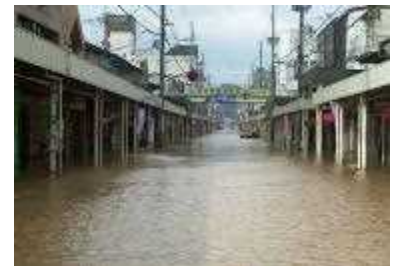
Submerged Toyooka city center (2004)

*Efforts against earthquakes are described in E.1.5.2.