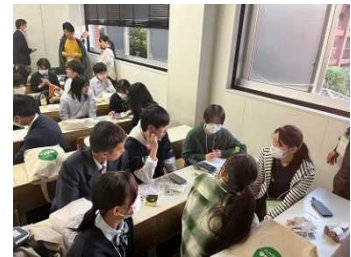
Discussions with high school students from other Geoparks at the Japan Geopark National Convention