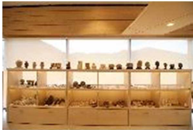
Showcase at the shop on October 19, 2023

A series of dialogue meetings including an on-site dialogue in November resulted in a replacement of geological products to non-geological products, such as replicas, on a trial basis.