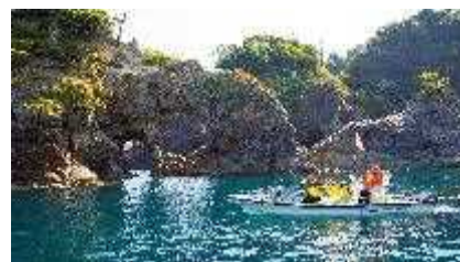
Kasumi Sea Taxi

Taking advantage of characteristics of the region, such as the sea and mountain, the geotourism is being developed, and approximately 65 organizations provide activity experiences throughout the area. At Tottori Sand Dunes, it is possible to experience activities such as sandboarding and paragliding that take advantage of the unique topography of the sand and slopes. In the coastal areas increasing number of people enjoying geocanoes and pleasure boats and further, various activities such as stand-up paddle and snorkeling are enjoyed throughout the area. In 2022, for promotion of increasing attractiveness of marine activities from geopark perspective, classroom lectures on the geology of the San'in Kaigan UGGp for marine activity operators were held and practical guide textbooks incorporating the opinions of guides and participants were prepared. Sea taxis and excursion boats operated by fishermen are in operation and that allows visitors to tour scenic spots such as the Kasumi Coast, Tajima Mihonoura, and Uradome Coast, enabling visitors go through sea caves that are difficult to access by large boats.