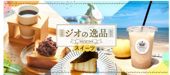
San'in Kaigan UGGp website: Introduction of Geo's special products (sweets)