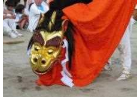
Kirin Lion Dance

The diverse geological and geographical features of the San'in Kaigan UGGp with undulation and varied terrain have various impact on people's lives, history and culture of the local communities. The climate on the Sea of Japan Coast brings a large amount of snow and rain to the area, and the abundant spring water supports industries such as sake, Japanese paper, and crepe cloth, and the Salix koriyanagi (species of willow), which grows naturally in wetlands, supported the development of basket weaving techniques introduced from the continent to help local residents initiate a bag-making industry. These industries brought wealth to the local economy, led the region to sustainable development even during off-seasons for farming and fishing, and promoted cultural promotion. Local folk events such as theatrical play and dances, which have developed as entertainment for local residents, and festivals and rituals held to pray for good harvests and good health, are protected as intangible heritage today