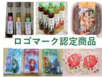
Certified Products with Logo