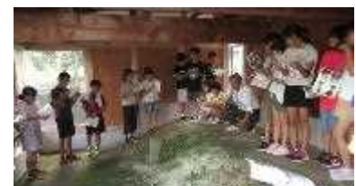
Learning the Mother Earth, Kyotango City

In the past 100 years, the San'in Kaigan UGGp was struck by big earthquake three times and great damage was caused. They are the Kita-Tajima Earthquake (M6.8,1925), the Kita-Tango Earthquake (M7.0,1927), and the Tottori Earthquake (M7.0,1943). To take advantage of the lessons learnt, disaster risk reduction learning and memorial events are being held in various places. The original ground displacements are still preserved today at the Gomura Fault, caused by the Kita-Tango Earthquake and at the Shikano Fault, caused by