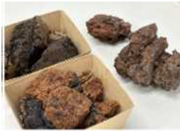
Scoria of Kannabe Highlands (right) and Scoria Sweets (left)