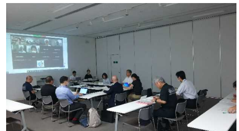
The First Task Force Meeting on Measures Against Sales of Geological Material