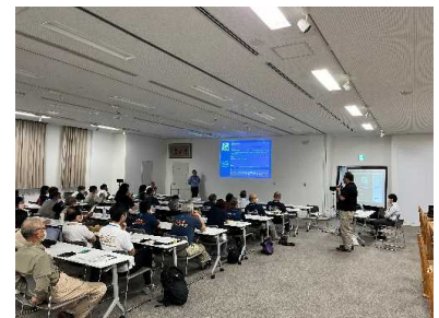
Workshop on selling of geological material

⇒ Comments of participants: "This problem is not someone else's problem, but something close to our heart." "As a guide, I would like to be able to explain to children why sales are bad at a level that they can understand." There were opinions that a change in awareness was observed, and not only the Council but also local residents had a deeper understanding of the issues surrounding San'in Kaigan UGGp and the philosophy of UGGp.