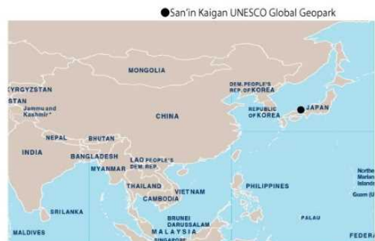
This map is a standard UN map downloaded from the UNESCO official website and does not represent the position of the Japanese Government.

The area of San'in Kaigan UGGp includes whole administrative districts of Kyotango City (Kyoto Prefecture), Toyooka City, Kami Town, Shin'onsen Town (Hyogo Prefecture) Iwami Town (Tottori Prefecture) and the northern and western administrative district of Tottori City (Tottori Prefecture) (see Annex 5 for details).