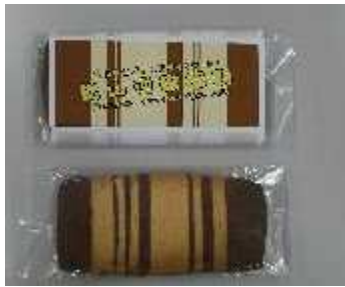
Matsuyama Geomagnetic Reversal Cookie

Rebuilding the certification system will be considered in line with the future review of the Master Plan.