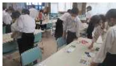
On-site SDGs Lesson at junior high school

Geopark experts have conducted on-site SDGs classes using card games, visiting at junior high schools and high schools within the geopark area, and over the past three years, the classes have been held 45 times at 21 schools, to over 1,400 students. In the second half of the class, the lecture about environmental problems is given, such as a large amount of plastic waste that washes up on the coasts of geopark areas and this problem cannot be solved unless it is considered on a global scale. Comments of the participating students are, for example, 1) I understood why the world needs the SDGs, 2) I understood that discussion and cooperation are essential to achieving the goals, and 3) Making the world "visible" changes people's consciousness., and 4) I felt that we could change the world for better or worse through our own actions.