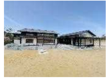
Tottori Sand Dunes Field House