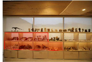
Showcase at the shop on November 11, 2023 (Red Area: Experimental products such as replica)