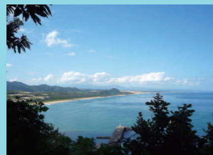
The scene from a viewing rest station