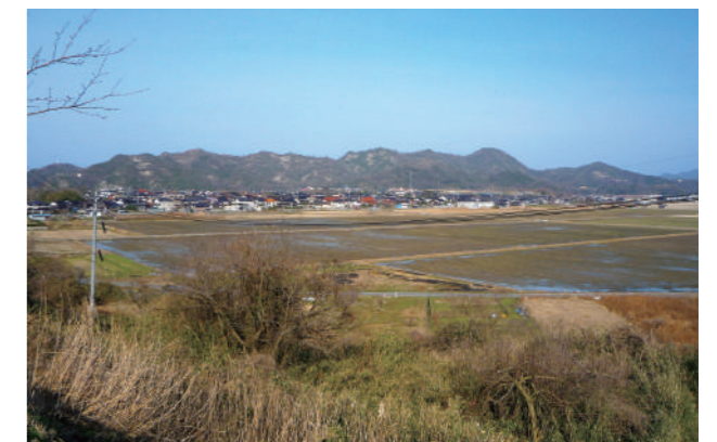
Otani Stream as of now in which rice paddies stretch