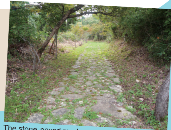
The stone-paved road