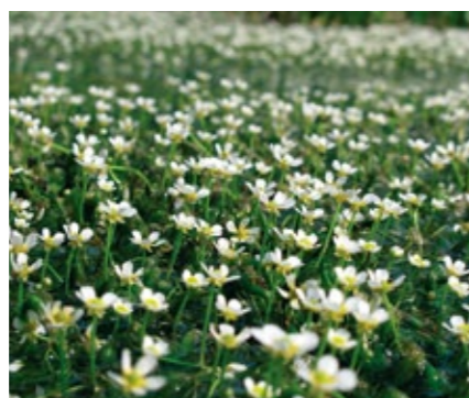
Baikamo (Ranunculus nipponicus)