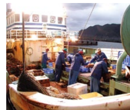
The Fishing Industry