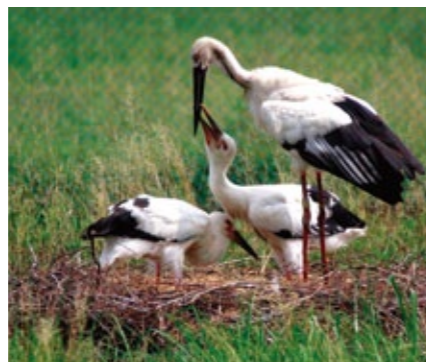
Oriental White Storks