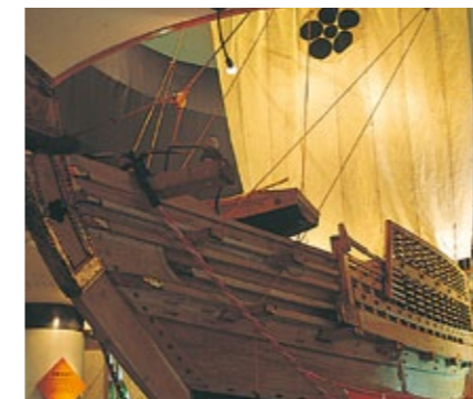
The Kitamaebune Ships

The various cultures and industries unique to the environment of the San'in Kaigan region are being utilized as tourism resources.