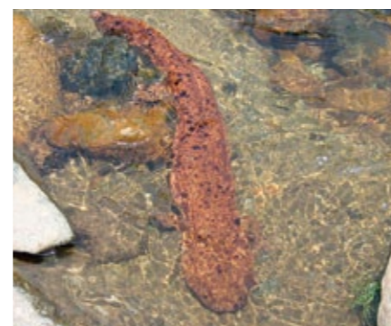
Japanese Giant Salamander (Andrias japonicus)