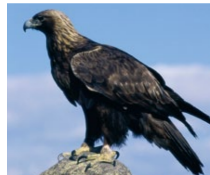
Golden Eagle (Aquila chryseatos)