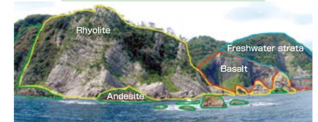
Yoroi no Sode (Kasumi Kaigan)

The Japanese Archipelago began to separate from the Asian Continent about 20 million years ago and formed the Sea of Japan. At the San'in Kaigan Geopark, you can find lots of geological assets from the period of the formation of the Sea of Japan.