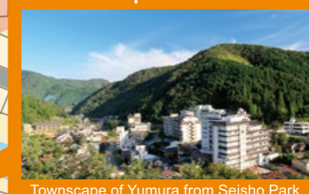
Townscape of Yumura from Seisho Park