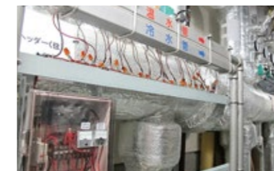
Power Generation Equipment (Yakushiyu)

Yumura Hot Springs boasts an abundance of hot water and has attracted many visitors as therapeutic baths for a long time. "Tajima livestock market", an auction market for Tajima cattle, was established in 1925 as one of the local industries. A great amount of excellent Tajima cattle has been shipped from here to all over Japan. The hot spring water itself is open to public as a common property of the region, and local people use it for boiling vegetables and crabs, as well as for washing.