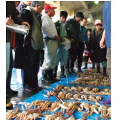
Auctioning crabs caught off the coast of Sanin