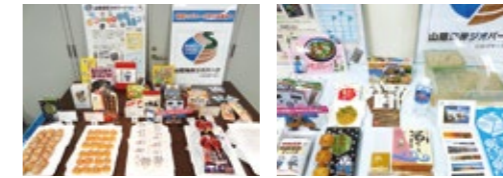
San'in Kaigan Geopark's logo-certified products