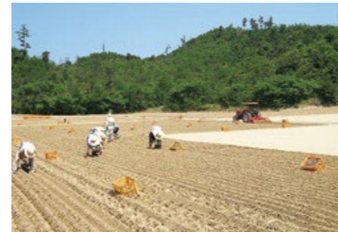
Chinese scallion field

In San' in Kaigan Geopark, local residents, private organizations, companies, and the government cooperate with each other and preserve diverse local resources such as the remains of the geological activities on earth and use such resources for education , tourism , and local industries . Activities aimed at the development of a sustainable local community have been conducted.