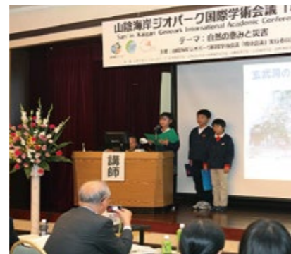
San'in Kaigan Geopark International Academic Conference