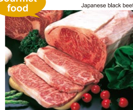
Japanese black beef