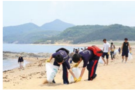
Cleaning activities along the beach