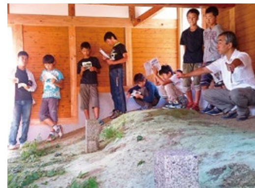
Study meeting for elementary school students