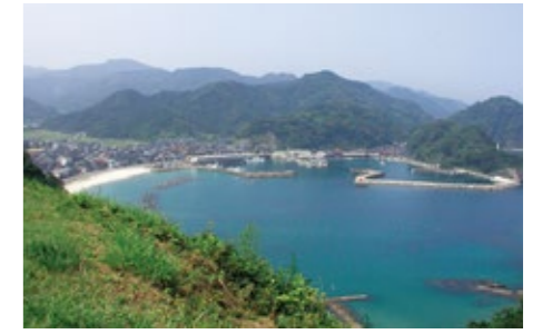
Kazemachi-ko Port using the ria coast