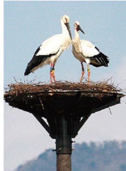
Activities for the protection of Oriental White Storks