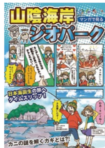
Comic brochure for children