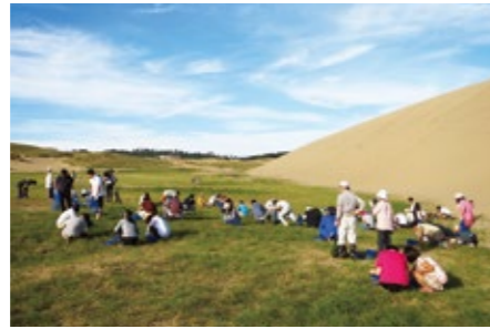
Weeding activities in the sand dunes